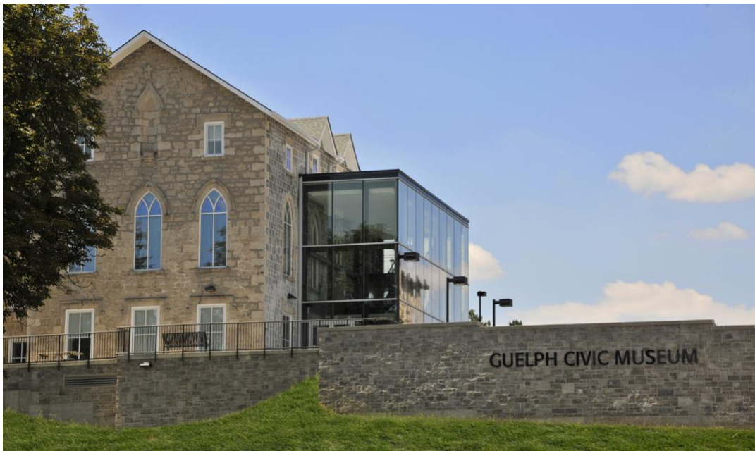
Image description: A photo of the front of Guelph Civic Museum from Norfolk Street. The Guelph Civic Museum sits at the top of a hill overlooking downtown Guelph. Its main building is made of stone, with a modern glass entranceway. "Guelph Civic Museum" is written in black block letters on a stone wall in front.